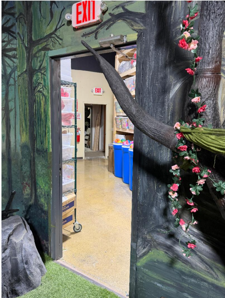
Approximately 26' from exit to exterior exit