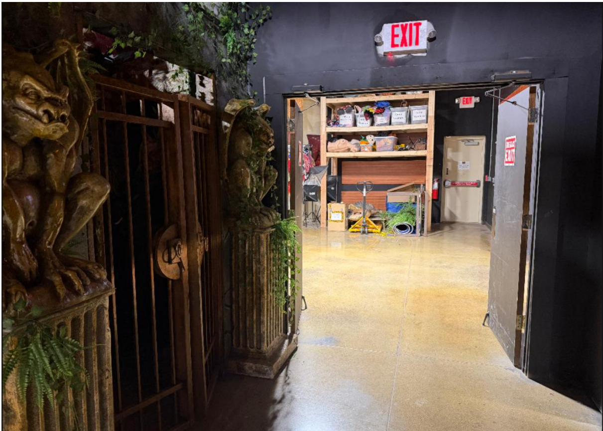
Approximately 30' from entrance to exterior exit